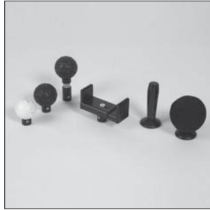
EU 23 – 28 Joystick options