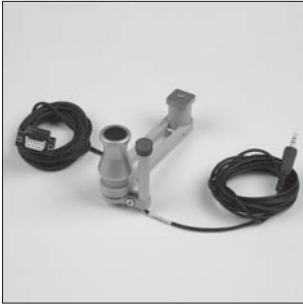
EU 40 Calibratable joystick