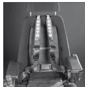
EP 51 Four-way chest strap