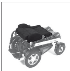
EC 45 Seat bottom X