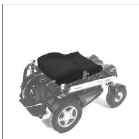
EC 44 Seat bottom F