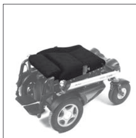
EC 46 Seat bottom W