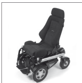
EC 40 Recaro N-joy