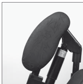
EB 80 Lateral leg pad