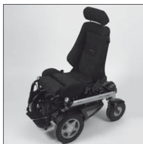
EC 42 Backrest LX