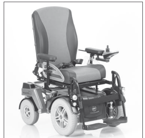
Figure shows add. charge options