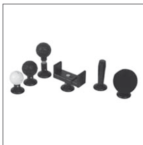
EU 23 – EU 28 Joystick options