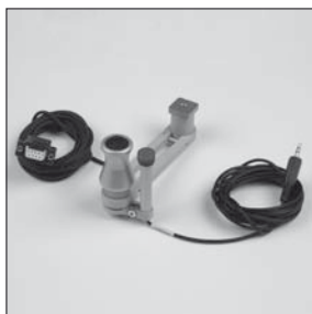
EU 40 Calibratable joystick