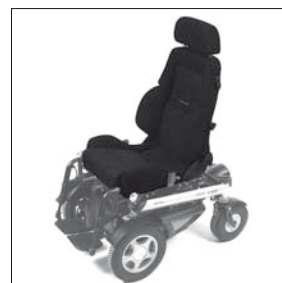
EC 43 Backrest LT