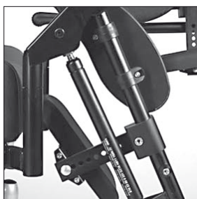
EB 20 Elevating footrest