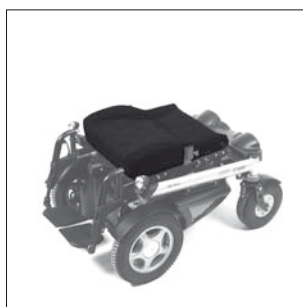
EC 44 Seat bottom F