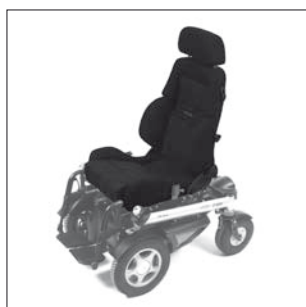
EC 43 Backrest LT