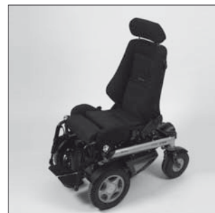
EC 42 Backrest LX