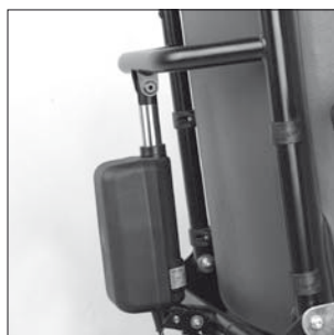
Electric back angle adjustment 30°