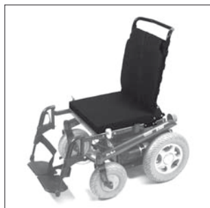
EC 01/02 Standard seat