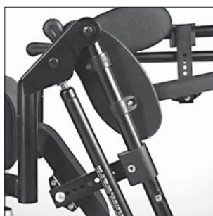
EB 20 Elevating footrest