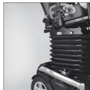
EC 55 Lift seat