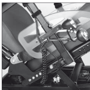
EC 50 Electric seat tilt