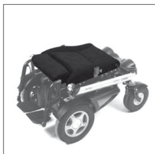
EC 46 Seat bottom W