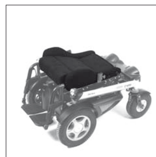
EC 45 Seat bottom X