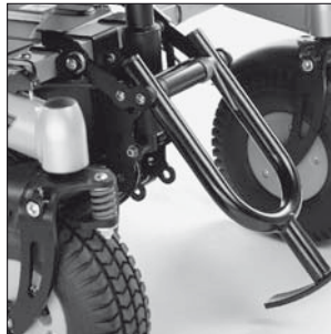
ET 04 Curb climbing assist