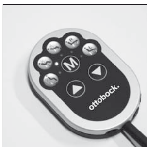
EU 07 Push-button module