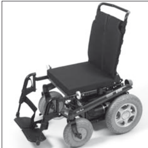
EC 01/EC 02 Standard seat