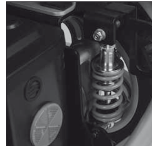
EG 05 Drive wheel suspension