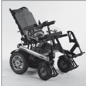
EC 50 Electric seat tilt 20°