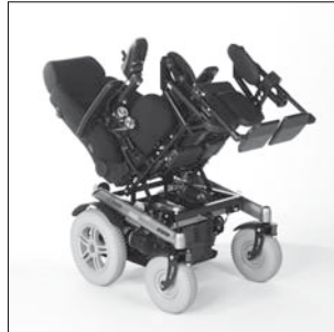
EC 54 Electric seat tilt 45°