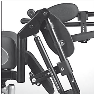
EB 20 Mechanically elevating footrest