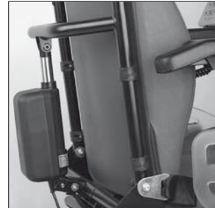
ED 50 Electric back angle adjustment 30°