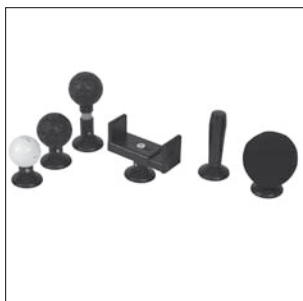
EU 23 - EU 28 Joystick options