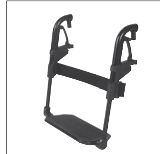
EB 03 Single-panel footrest