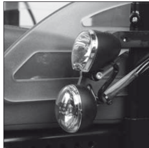
ES 50 Electric LED lighting