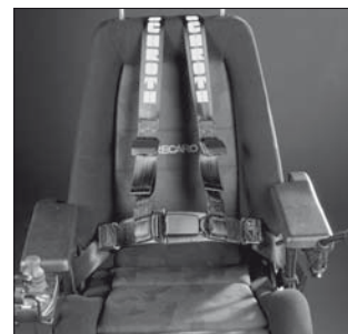
EP 51 Four-way chest strap