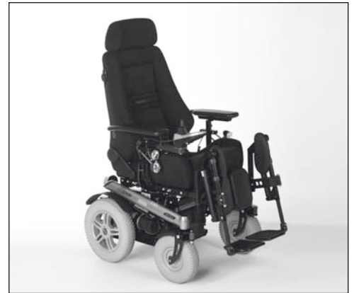
Figure shows add. charge options

Maximum load capacity: 140 kg/309 lbs Article number: 490E32=00000_C