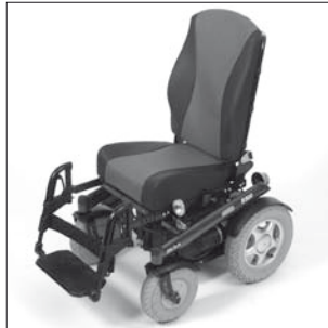
EC 03/EC 04 Contour seat