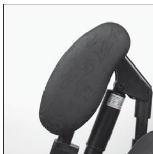
EB 80 Lateral leg pad