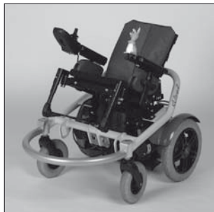
EC 50 Electric seat tilt