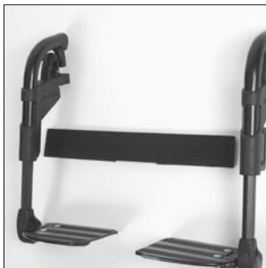
EB 02 Individual footrests