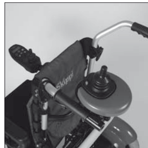
EU 15 Attendant control