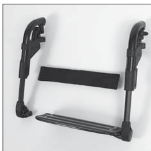
EB 05 Single-panel footrest