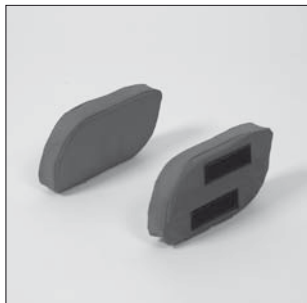
EE 37 Lateral pads