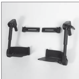
EB 20 Mechanically elevating footrests