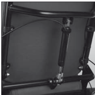
ED 20 Mechanical back angle adjustment 30°