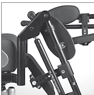
EB 20 Mechanically elevating footrest