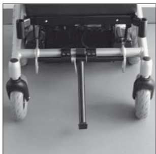
EF 07 Curb climbing assist, to overcome curbs with a maximum height of 10 cm