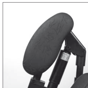
EB 80 Lateral leg pad