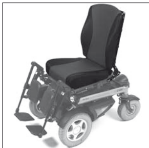
EC 03 Contour seat