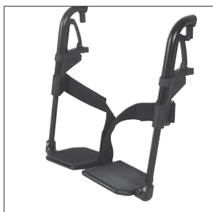
EB 02 Individual footrests with aluminium footplates